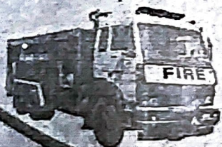
Fire : 101